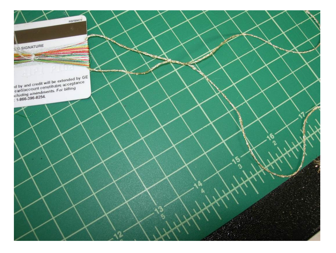
STEP 6: Wrap your Tassel

Carefully slide your tassel off its template. If you did your hanging loop using the second method, put the knot of the loop under the threads of the tassel.