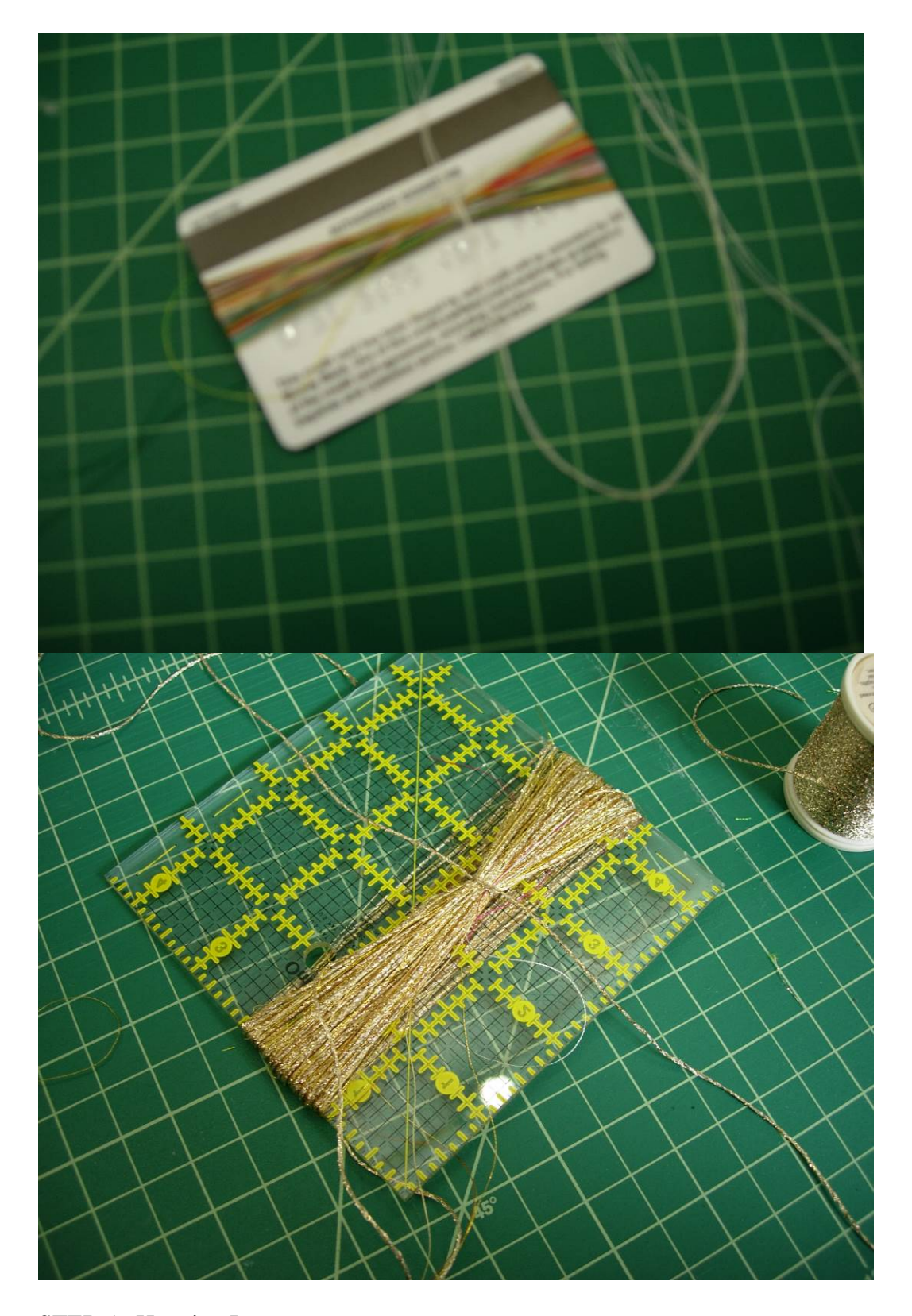
STEP 5: Hanging Loop